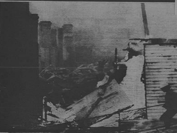
● THESE graphic pictures show the two angles of Hobart's disastrous fire yesterday. The top picture was taken from the south looking up the Derwent towards the 7000ft. cloud of smoke over the city. Bottom — Fire licks out a remaining timber section of a group of tenements in Waterworks Rd. Conynon. Brick fireplace pillars were all the fire left.